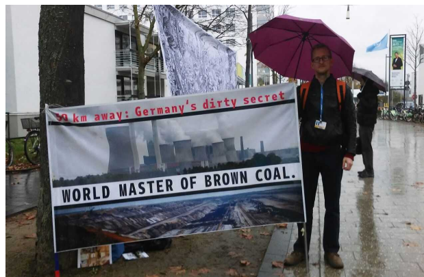
Illustration 9: The Coal vigil outside the main entrance to COP23.

Outside main COP23 entrance we manned a coal information point, drawing attention to the coal being mined just outside Bonn and the destruction of the beautiful Hambach Forest and exposing the unwillingness of the German and NRW governments to let go of coal. We coordinated a shuttle service with volunteers from the region which allowed over 100 journalists, government and non-government COP delegates to visit Hambach Forest and Hambach Mine – Europe's biggest coal mine.