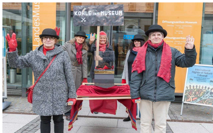
Illustration 7: Putting coal into the museum - Action framing the Lignite case at the Rights of Nature Tribunal

We helped organize the case on German lignite and held a training session on climate game changers at the International Rights of Nature Tribunal.