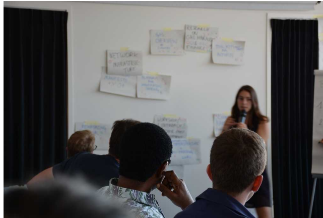
Illustration 2: Gastivists facilitating a strategy meeting

We organized a double digit number of actions, meetings and events around gas at and during COP23 in Bonn where besides reaching hundreds of delegates, we got an excellent social media response (tens of thousands of views), as well as some newspaper and TV coverage. (Democracy Now programme on fossil gas: https://www.democracynow.org/2017/11/16/activists_at_cop23_decry_companies_corporate )