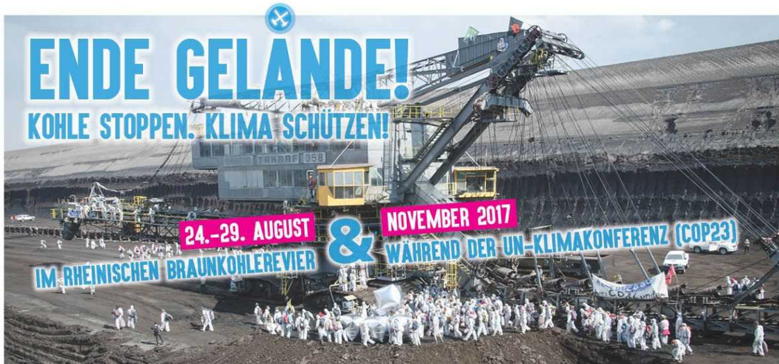
Illustration 6: Invitation for Ende Gelände 2017

LINGO is part of the Ende Gelände coalition and in 2017 we helped organize two successful actions of mass civil disobedience. We helped with translation and action logistics (August) and mobilization, speaker's programme, translation coordination (November) and some minor tasks.