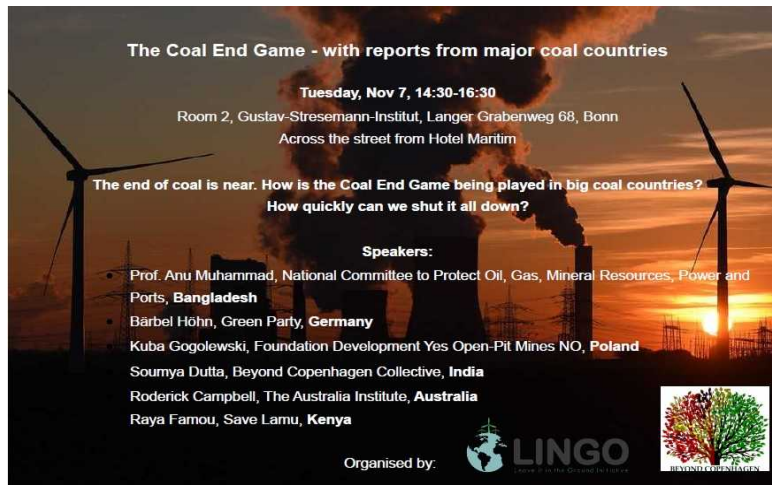
Illustration 8: Announcement of the Coal End Game workshop

We organized a workshop together with partners from India, featuring former Minister of environment of Northrhine Westphalia Bärbel Höhn and speakers from four continents.