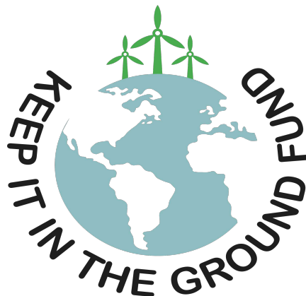
Illustration 5: Keep it in the Ground Fund logo

We created a website and visual identity for the Keep it in the Ground Fund which aims to channel resources which are currently used for offsetting projects towards more effective efforts to keep millions of tons of CO 2 in the ground.