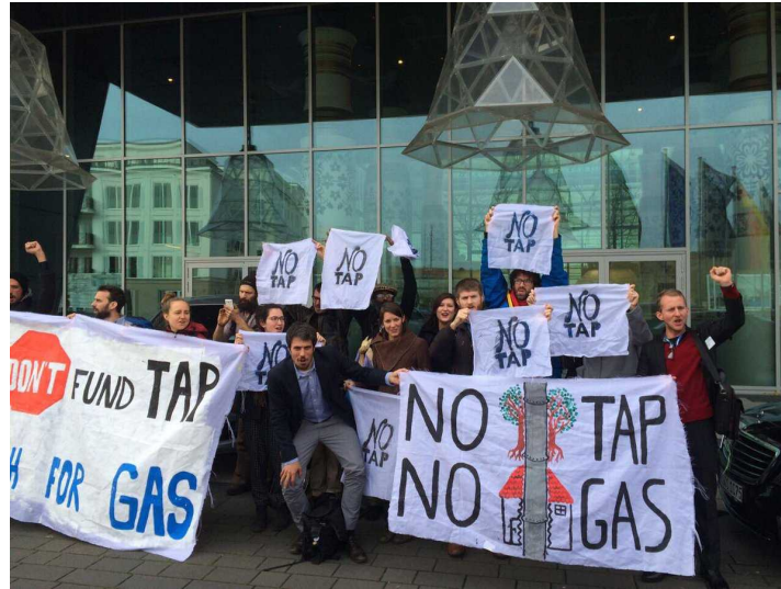
Illustration 4: NoTAP solidarity action in Bonn

We organized an international “NoTAP” Day of Action with actions in nine cities in 7 countries. TAP stands for the Trans-Adriatic Pipeline, a major fossil gas pipeline currently trying to get multibillion Euros of public support.